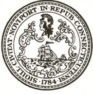
Justin Elicker Mayor