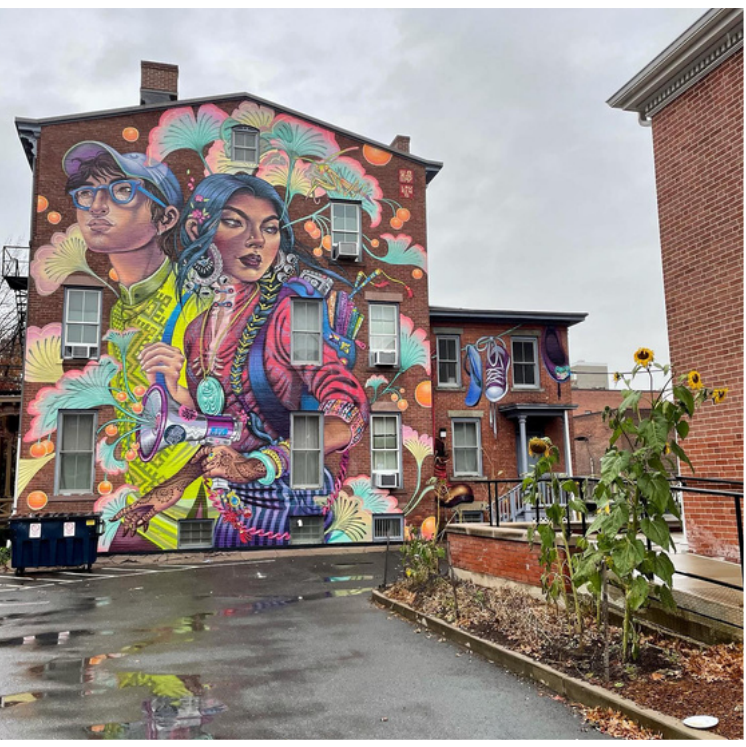
Neighborhood Music School Dance Department