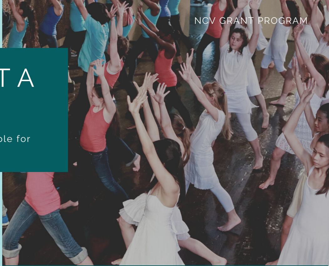
Neighborhood Music School Centennial Celebration, Woolsey Hall