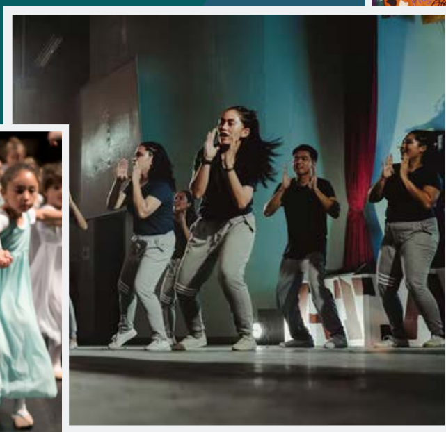
Neighborhood Music School