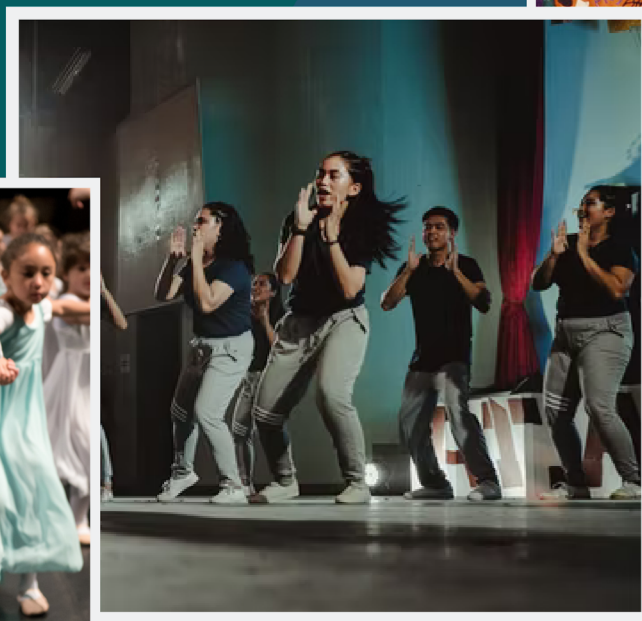
Neighborhood Music School