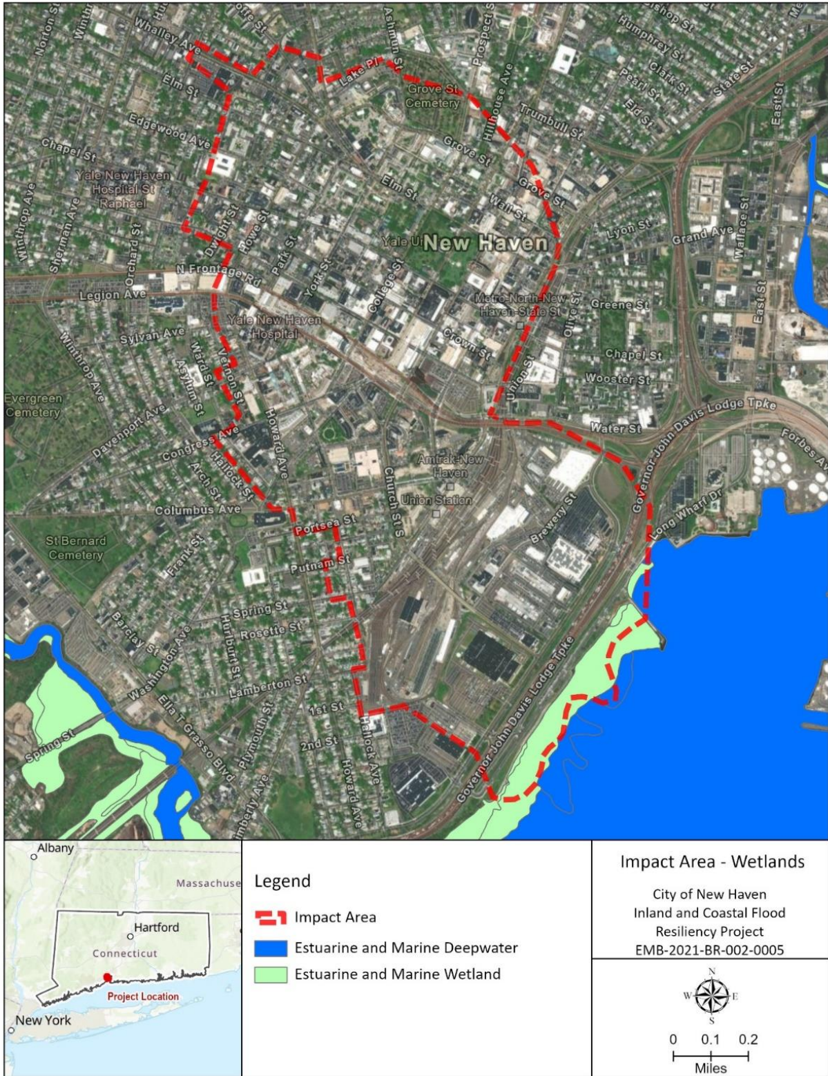
Figure 4-1. Project Area Wetlands