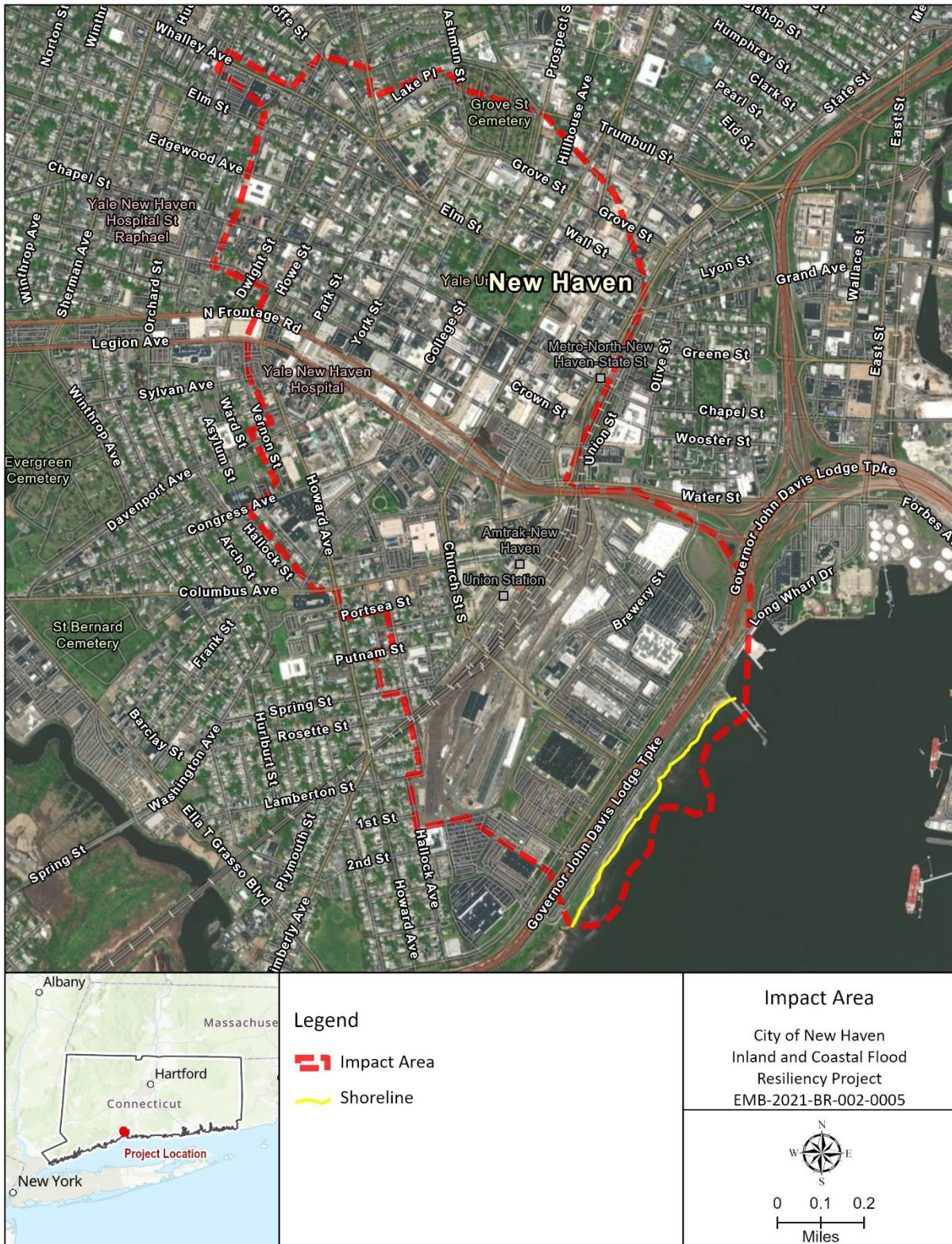
Figure 1-1 Project Impact Area