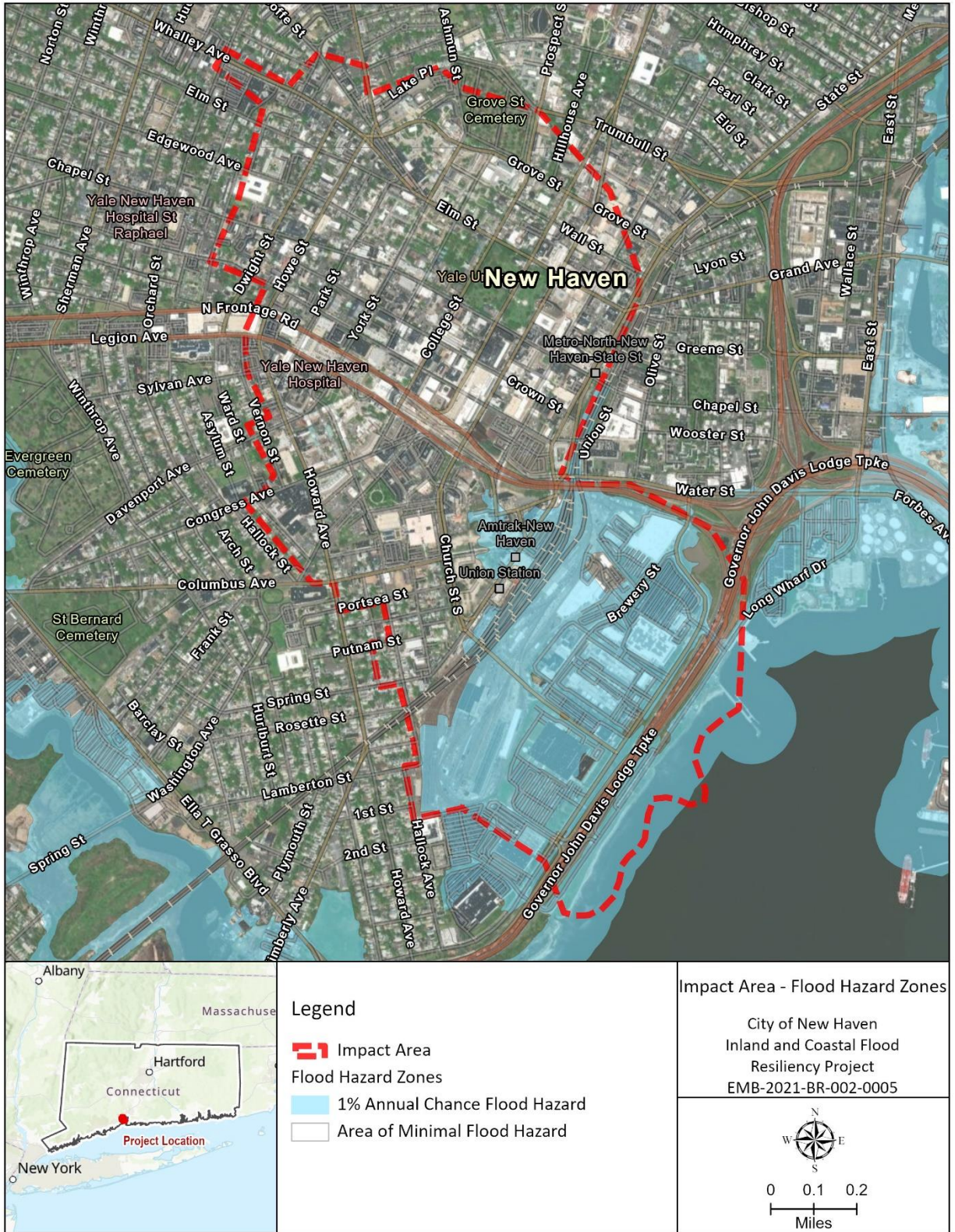
Figure 4-2 Floodplain Map