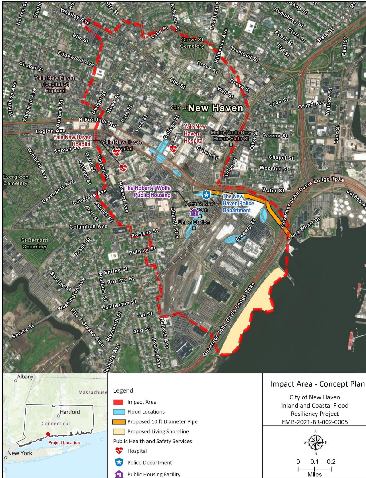
Figure 3-1 Impact Area