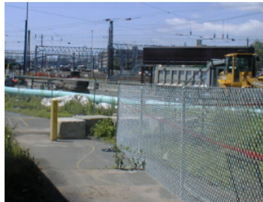
(left) Southern terminus of the Vision Trail beneath I-95. UI's Harbor Station can be seen in the distance. (right) The entrance to the Vision Trail at Water Street. The rail yard is visible in the background