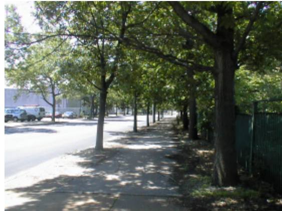
(left) Looking north along Union Parkway near Water Street. High School in the Community is at right. Note ample width for a share-the-streets treatment for the trail (right) Looking south along Union Parkway near Chapel Street.