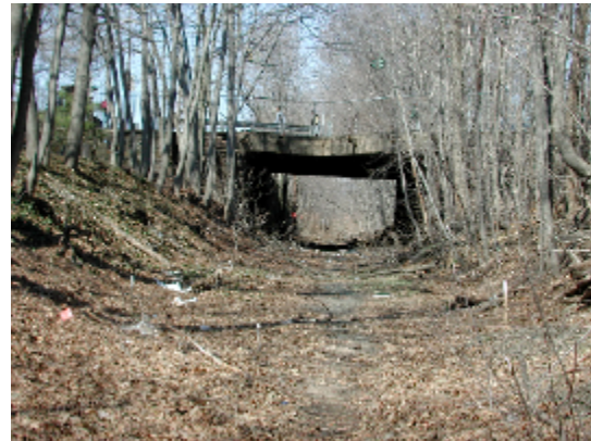
(left) Looking south along the right-of-way beneath the Hillhouse Avenue Bridge (right) Looking north along the right-of-way beneath the Prospect Street Bridge

The character of the row changes north of Temple Street. In the first two blocks from Temple Street to Prospect Street, the route is owned by Yale University and is surrounded primarily by buildings related to Yale. There is limited access from street level through parking lots and driveways adjacent to the buildings. Yale intends to build a portion of the greenway between Hillhouse and Prospect as part of site work for its new Engineering building.