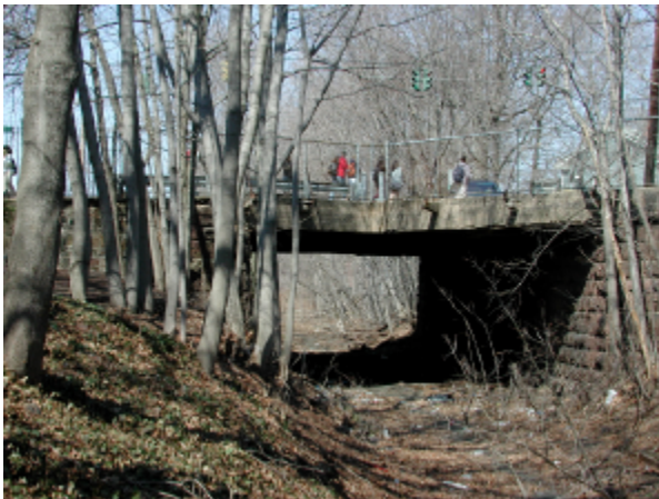
The Farmington Canal Greenway (left) and the Orange Street Bike Route are grade-separated at the Prospect-Trumbull-Canal intersection. Making an interchange between these two routes is fundamental to creating a network of greenways, trails, and bicycle routes in New Haven.

-Connect to the Orange Street bike route. The Farmington Canal Greenway and the Orange Street bike route cross at separate grades at the Prospect-Trumbull-Canal intersection. Since the City proposed a system of Greenways, connecting these two bicycle/pedestrians corridors is fundamental to creating a network of non-motorized transport routes through New Haven. Connection might be made easily at Prospect Place or Sachem Street