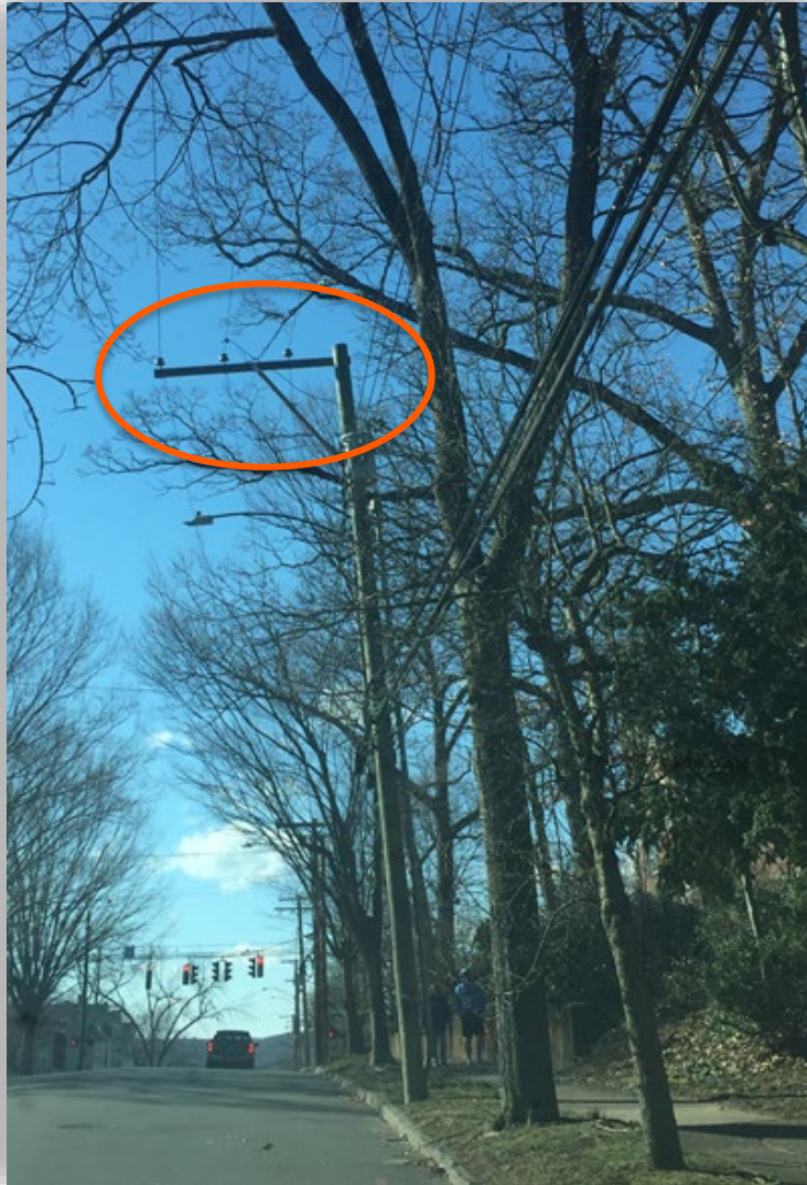
Fully Outrigged Pole