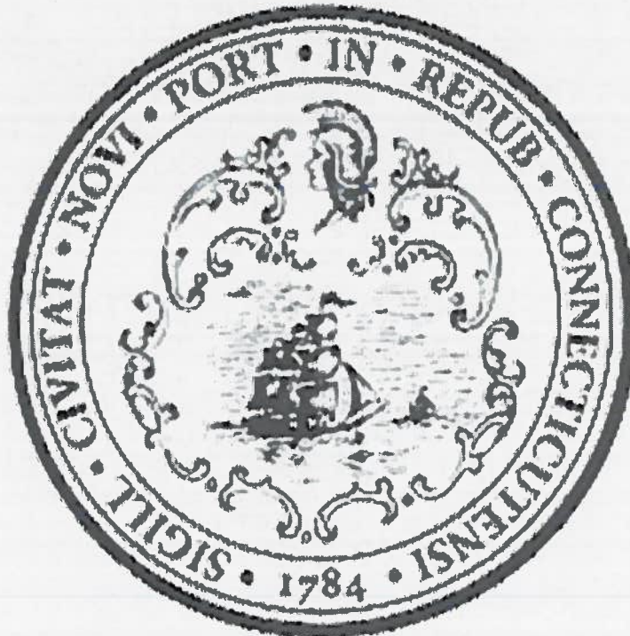
The Seal Of The City Of New Haven